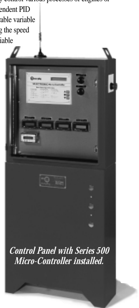
Control Panel with Series 500 Micro-Controller installed.

The Series 500 is not limited to these applications. It is designed to accommodate the most demanding automation needs. The Series 500 is applicable in situations requiring many inputs and/or outputs and where very precise set points and timing periods are required. It is especially useful when easy customer interface is desirable.